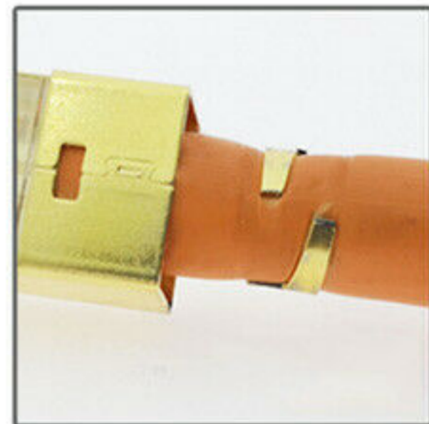
8. Finished !!