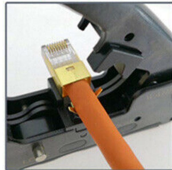
5. put it into the crimping slot press it into correct position.