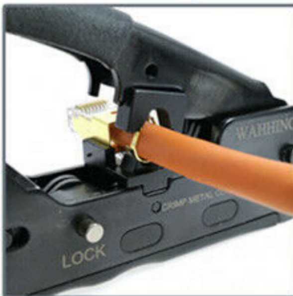
6. make the two "swings" as closed as you can otherwise can not crimp it .