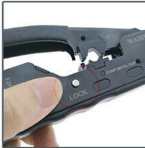
1. Press hand shank and push button "LOCK" > Release