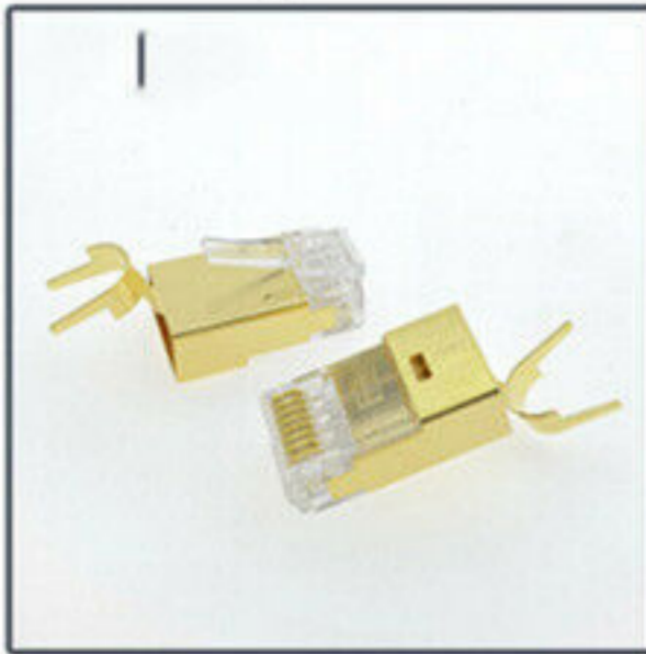
Crimp Metal Clip of RJ45 Cat7/6a STP Plugs