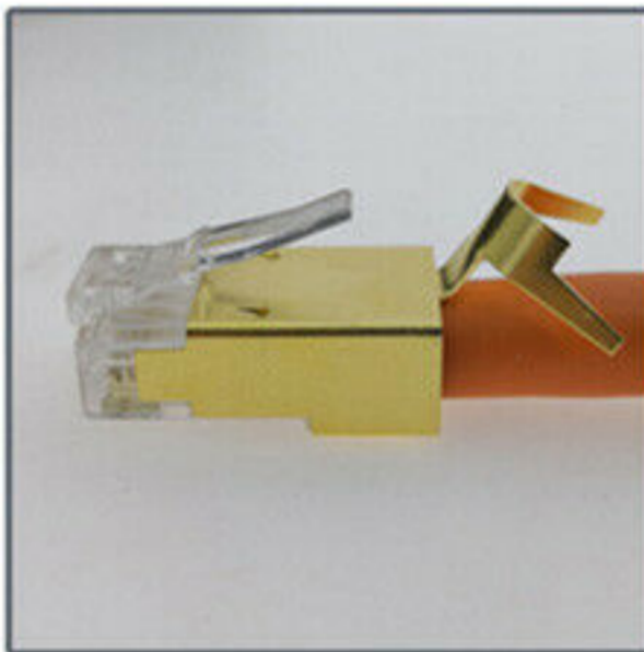
3. after crimped the 8P plug close the "metal clip"