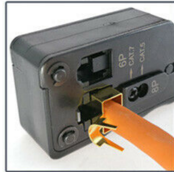
2. Put the wired-plug into the 8P, Press handshank hardly to crimp the plug.